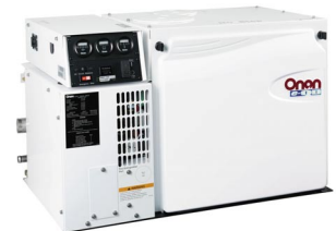
Onan Optional Sound Shield Model pictured has optional gauges