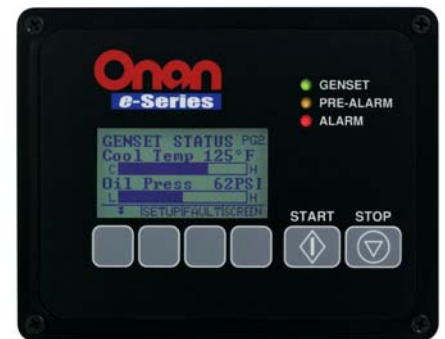
e-Series Digital Display