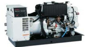
Standard Model without Sound Shield Shown.